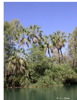
In riparian habitat [not vouchered].