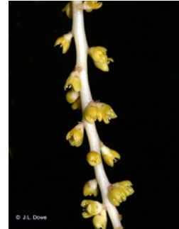
Flowers [not vouchered].