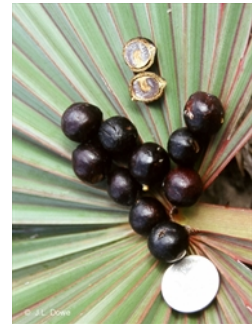
Fruit, whole and in longitudinal section to reveal seed coat intrusion [not vouchered].