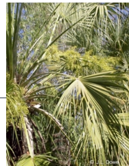
Crown with inflorescences [not vouchered].