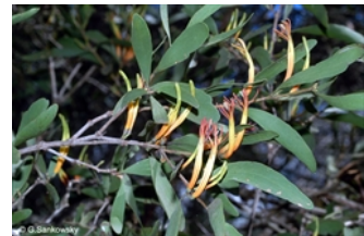
Leaves and flowers. © G. Sankowsky