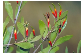
Leaves, flowers.