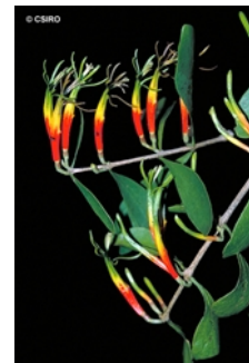
Leaves, flowers. © CSIRO