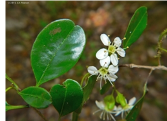
Flower and leaves [not vouchered].