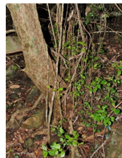
Bark [not vouchered].