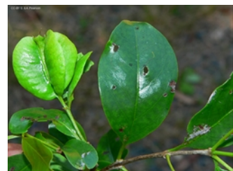
Leaf and fruit [not vouchered].