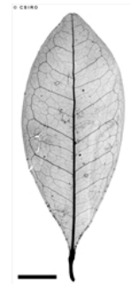
Scale bar 10mm. © CSIRO

Copyright © CSIRO 2020, all rights reserved.