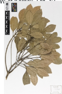
Leaves, Herbarium specimen.