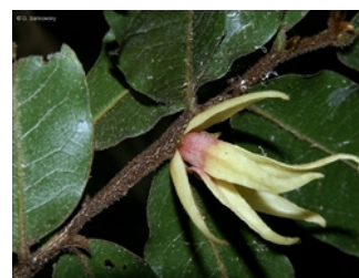
Flowers [not vouchered].