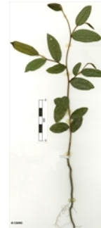
10th leaf stage.