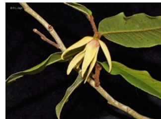
Flower.