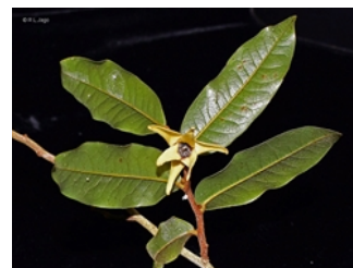
Leaves and flower.