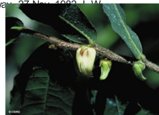
Flower and flower buds.