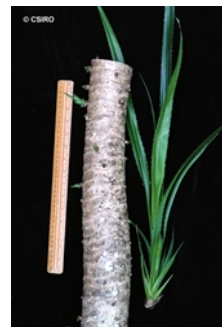
Stem with pups. Scale is a 30 cm ruler.