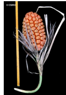
Fruit. Scale is a 1m ruler.