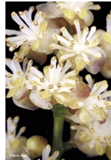
Male flowers.