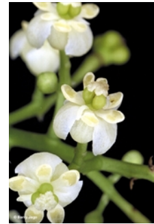
Female flowers. © Barry Jago