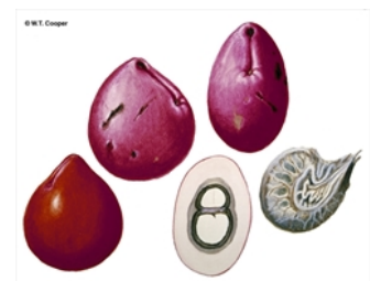
Fruit, 3 views, transverse section