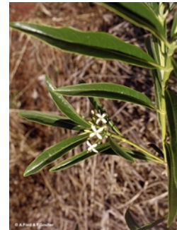
Leaves and Flowers.