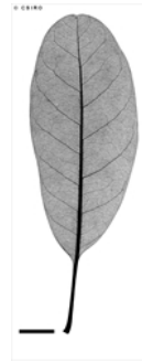
Scale bar 10mm.