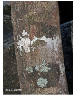
Trunk. © J.E. Kemp