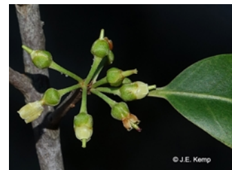
Flowers. © J.E. Kemp