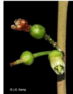
Flowers. © J.E. Kemp