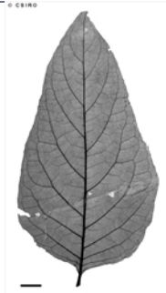
Scale bar 10mm.