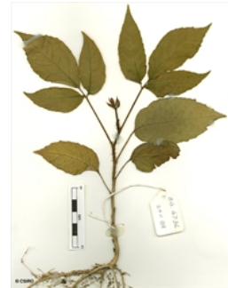
10th leaf stage.