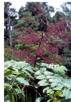
Habit, leaves and fruit.