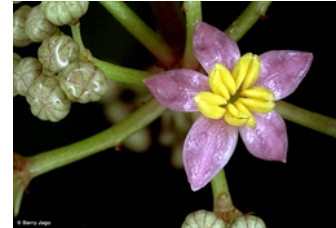
Flower and buds.