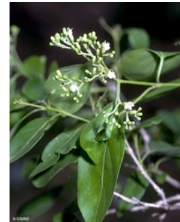
Leaves and Flowers. © CSIRO