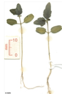
Cotyledon stage, epigeal germination.