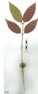
Cotyledon stage, hypogeal germination.