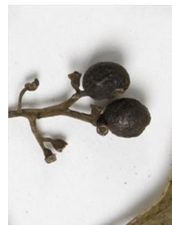
Herbarium sheet: fruit.