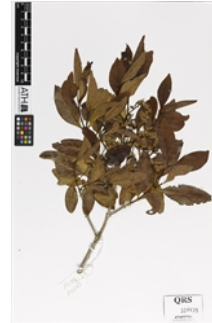
Herbarium sheet.