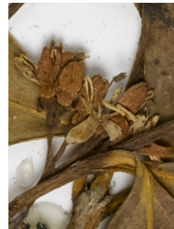
Herbarium sheet: flowers. CC-BY: ATH.