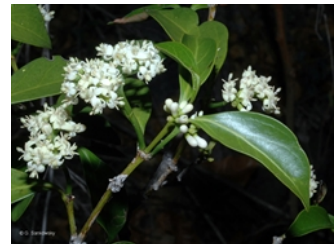
Leaves and flowers.