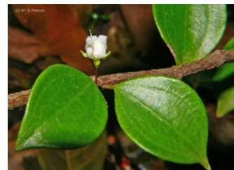
Leaves and flower [not vouchered].