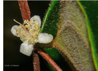
Flower [not vouchered].