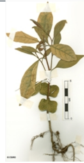
Seedling, cotyledons still attached.