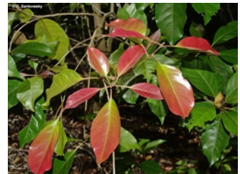
Young leaves [not vouchered].