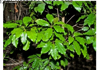
Leaves [not vouchered].