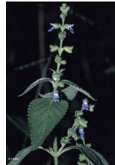
Leaves and flowers.