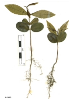
Cotyledon stage, epigeal germination.