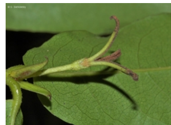
Female flower [not vouchered].