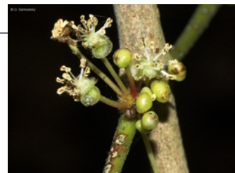
Male flowers [not vouchered].