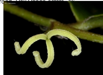
Female flower [not vouchered].