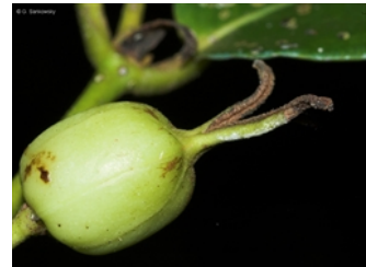
Fruit [not vouchered]. © G.