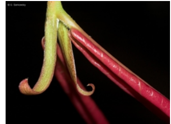
Stipules [not vouchered].