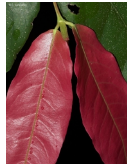
Young leaves [not vouchered].