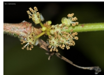
Male flowers [not vouchered]. © G.