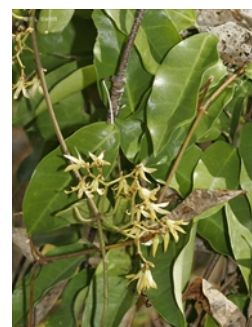
Leaves and inflorescence.