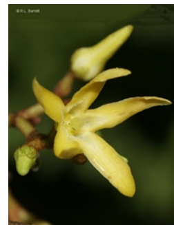
Flower. © R.L. Barrett