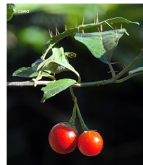
Leaves, Fruit.