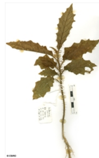
10th leaf stage.