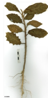
10th leaf stage.