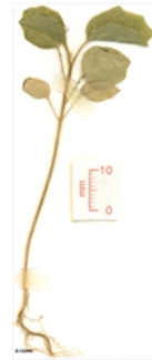
Cotyledon and 1st leaf stage, epigeal germination.