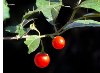
Leaves, Fruit.