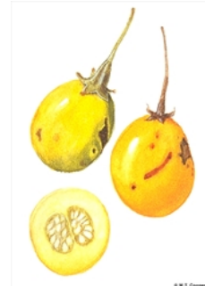
Fruit, side views and cross section. © W. T. Cooper

Copyright © CSIRO 2020, all rights reserved.