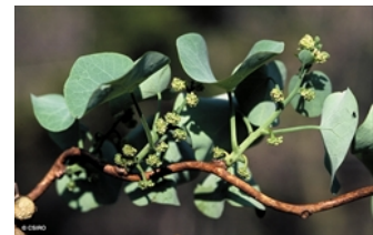
Leaves and Flowers. © CSIRO