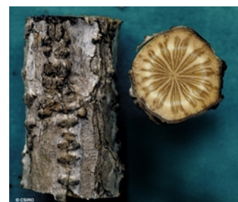
Vine stem bark and vine stem transverse section.