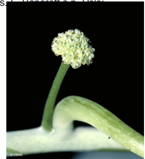
Female flowers. © CSIRO