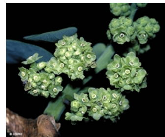
Male flowers.