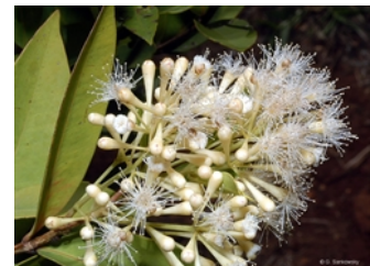
Flowers [not vouchered].