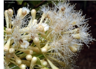
Flowers [not vouchered].