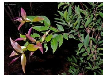
Leaves [not vouchered].