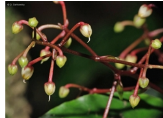
Flowers [not vouchered].