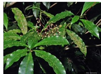
Leaves and flowers [not vouchered]. © G. Sankowsky