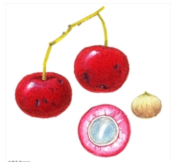
Fruit, side views, cross section and seed. © W. T. Cooper