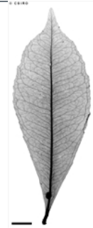
Scale bar 10mm.