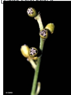
Male flowers.