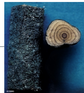
Vine stem bark and vine stem transverse section. © CSIRO

Copyright © CSIRO 2020, all rights reserved.