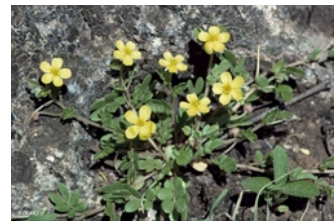
Leaves and flowers. © CSIRO