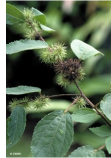
Leaves and fruit.