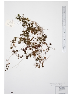
Herbarium specimen. © CSIRO

Copyright © CSIRO 2020, all rights reserved.