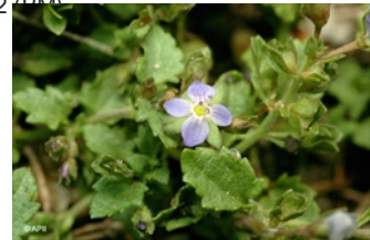
Leaves and flower.