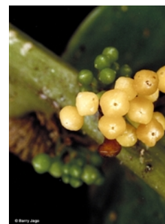
Flowers.