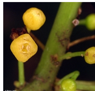
Flowers.