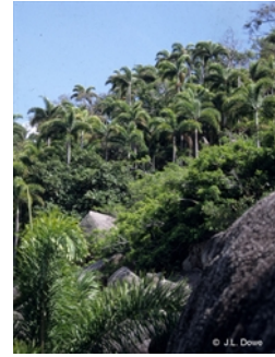
In open woodland with granite boulders [not vouchered]. © J.L. Dove