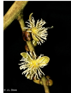
Male flowers [not vouchered]. ©