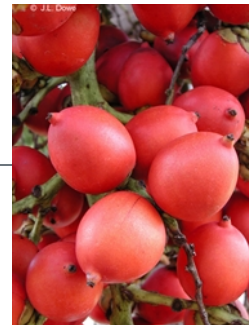
Mature fruit [not vouchered]. ©