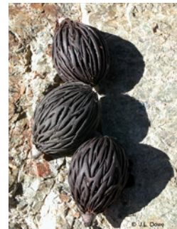
Epicarp removed to reveal mesocarp fibres [not vouchered].