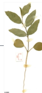
Cotyledon stage, epigeal germination.