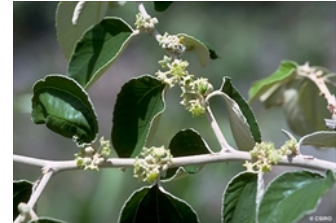
Leaves and Flowers.