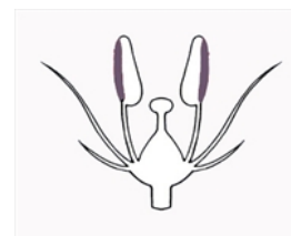
FL127 extrorse Anthers in the mature bud with their apparent lines of dehiscence facing outwards, i.e. abaxial.