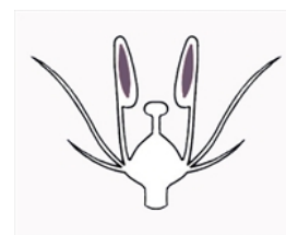
FL128 opening laterally Anthers in the mature bud with their apparent lines of dehiscence facing tangentially.