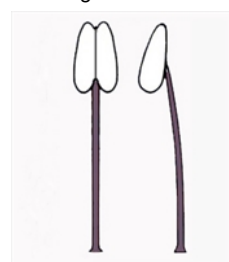
FL131 long more than 2.0 times length of anther