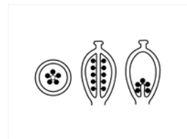
FL154 free central including free basal