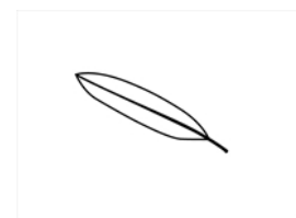
L16 more than 4.0