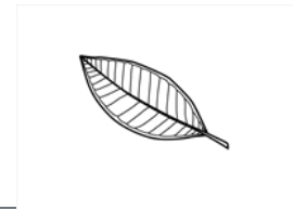
L15 1.5 to 4.0