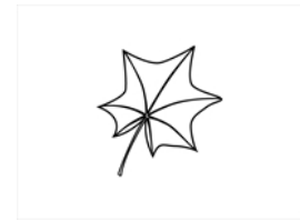
L14 less than 1.5