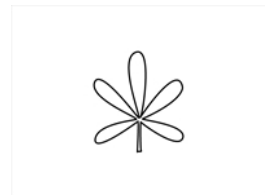
L104 palmatisect Having a leaf blade deeply (but not completely) divided into several lobes which arise at or almost from the same level.