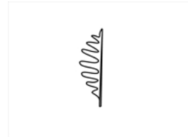
L102 pinnatisect Having a leaf blade deeply (but not completely) divided into lobes that are spaced out along the leaf.