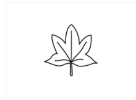
L103 palmatifid Having a leaf blade divided into several lobes which arise at or almost from the same level.