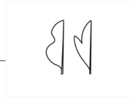
L100 lobed Having a leaf blade with lobes.