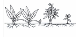
Rhizomes, stolons, root-suckers or culms Rhizomes are elongate, root-like stems which travel some distance from the parent plant below the ground. They may produce new plantlets from their tips or from buds along their length. Stolons are similar, but usually travel above the soil surface (e.g. strawberry runners). Includes adventitious roots along stems and at nodes.