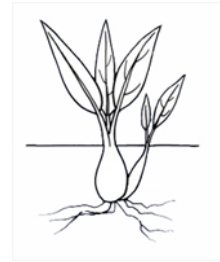
Underground bulbs, corms, tubers