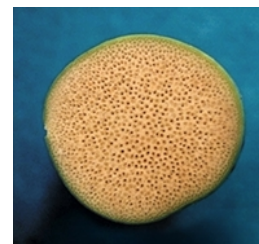
VB25 absent Usually absent on monocotyledons.