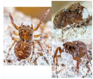
Examples of live Frewena sp.

* The information sheet should be interpreted in the context of the associated diagrams and photographs. Diagrams explaining anatomical terms can be found in the 'Salticidae' pictures at the beginning of the list of genera.