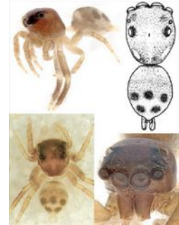
Aspects of the general morphology of Frewena maculata