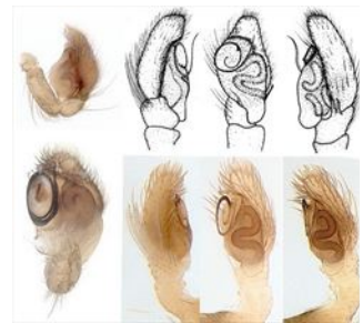
Palp morphology of Frewena n. sp. (L) and Frewena maculata