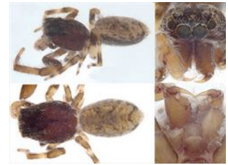
Aspects of the general morphology of Maddisonia

* The information sheet should be interpreted in the context of the associated diagrams and photographs. Diagrams explaining anatomical terms can be found in the 'Salticidae' pictures at the beginning of the list of genera.