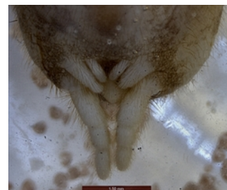
Fig. 4. Plesiothele fentoni female, spinnerets showing large outer pair (PMS).