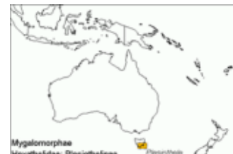
Fig. 3. Distribution map.