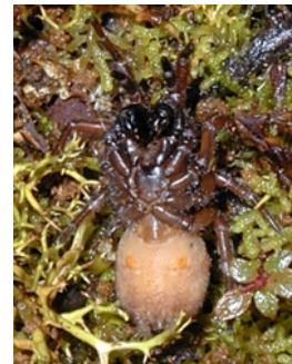
Fig. 2. Plesiothele fentoni , female, ventral view.