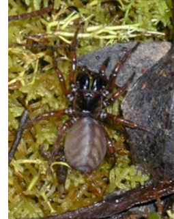
Fig. 1. Plesiothele fentoni , female, dorsal.