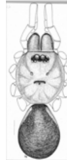
Fig. 3. Heteromigas sp. male dorsum.