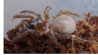
Fig. 1. Heteromigas sp. female, dorsal habitus.