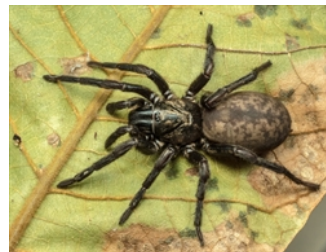
Stanwellia sp. female - Flinders Island, South Australia.