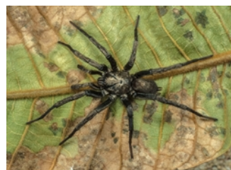
Stanwellia sp. female - Flinders Island, South Australia.