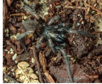
Starwellia sp. female - Flinders Island, South Australia.