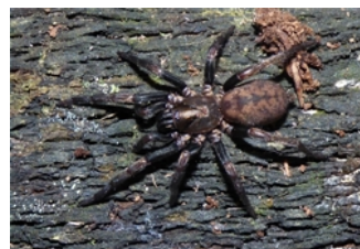
Stanwellia sp. female - Tasmania.