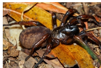
Stanwellia grisea female - Melbourne Trapdoor Spider, Bayswater North, Victoria.