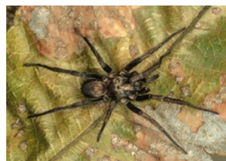
Stanwellia sp. female - Flinders Island, South Australia.