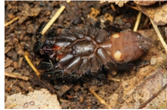
Starwellia grisea ventral aspect - Melbourne Trapdoor Spider, Warrandyte State Park, Victoria.