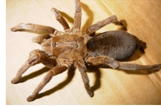
Fig. 1. Selenotypus sp.