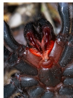
Fig. 4. Coremiocnemis tropix chelicerae - Surprise Creek, Kuranda, Queensland.