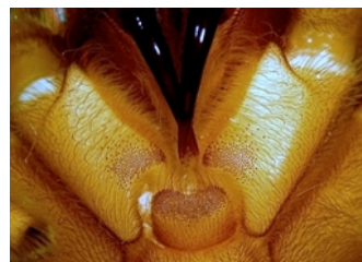
Fig. 9. Theraphosidae maxillae and labium.