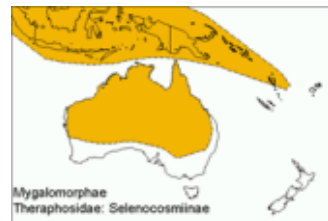
Fig. 7. Distribution map.