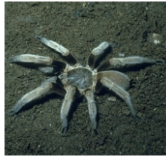
Fig. 5. Phlogius crassipes female showing characteristic thicker front legs.