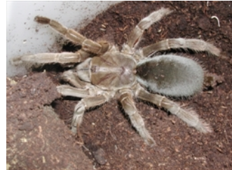
Fig. 6. Selenotypus sp.