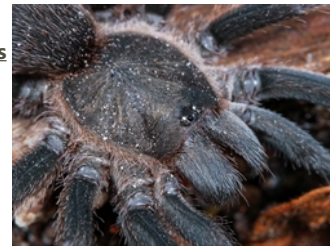
Fig. 3. Coremiocnemis tropix detail of carapace - Surprise Creek, Kuranda, Queensland.