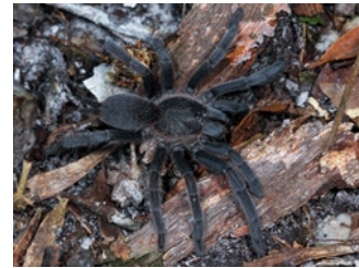
Fig. 2. Coremiocnemis tropix habitus - Surprise Creek, Kuranda, Queensland.