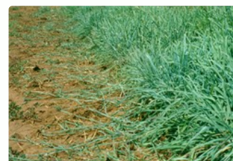
Stolon spread (cv. Strickland)