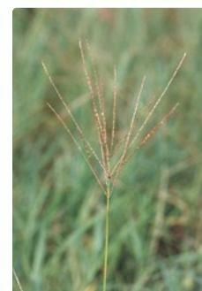
Maturing seed head