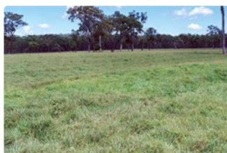
Seed production area before flowering, Childers, S.Qld, Australia (cv. Strickland)