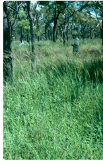
Pasture in open Eucalypt woodland, northern Australia (CPI 59587)

Africa: Angola; Botswana; Democratic Republic of Congo; Ethiopia; Kenya; Malawi; Mozambique; Namibia; Somalia; South Africa (Free State, Mpumalanga, Gauteng, North West, Limpopo); Tanzania; Uganda; Zambia; Zimbabwe