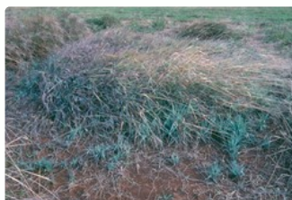
Plantlets developing along stolons, north Queensland, Australia