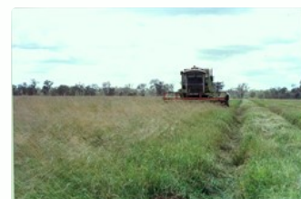
Harvesting seed, Childers, Queensland Australia (cv. Strickland)