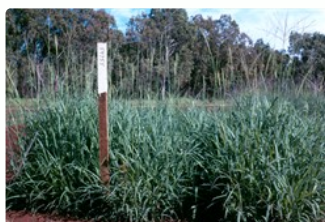
Extremely palatable, weakly stoloniferous form (CPI 59755)

English : digit grass, Makarikari finger grass, milanje finger grass, milanje grass, tall finger grass, woolly finger