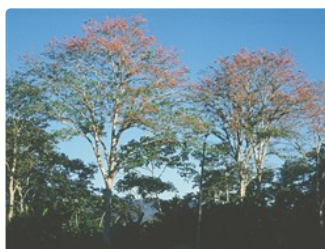
Tree to 25m