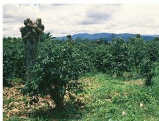
After pollarding in coffee plantation