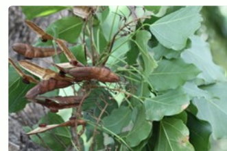
Pod chartaceous, slightly depressed between seeds