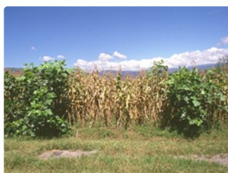
Alley cropping with maize