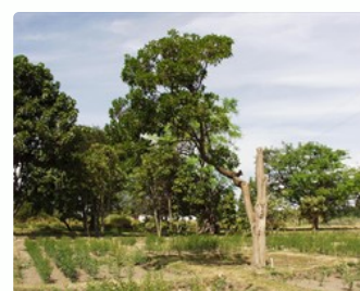
Cropping under E. poeppigiana (ILRI 15011)