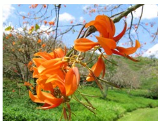
Flowers and immature pods on axillary raceme