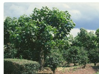
6-month regrowth after pollarding in coffee plantation