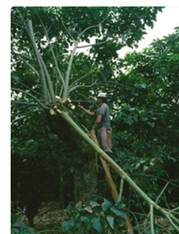
Pollarding; pruning 1-year regrowth from mature trees