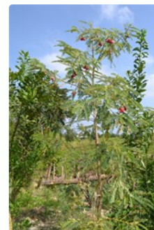
Young red flowering tree, Laos