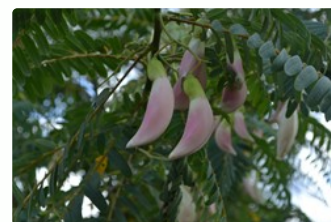
Pink flowered form, Brunei