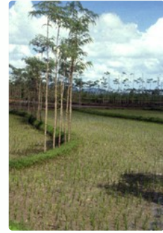
Planted on rice bunds, Lombok, Indonesia