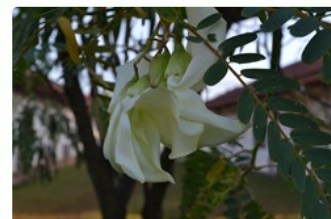
Pendulous axillary raceme comprising mostly 2-4 flowers