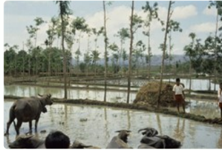
Planted on rice bunds, Lombok, Indonesia

S. grandiflora nodulates freely, fixing significant amounts of nitrogen. It is commonly grown on paddy bunds, and around gardens or cropping fields for its nitrogen contribution. Fruits, falling leaflets and flowers make excellent green manure or mulch and improve soil