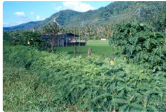
Used as a hedge, Indonesia