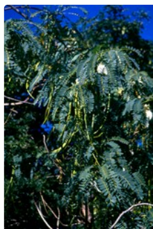
Leaves mostly 15 - 30cm long, paripinnate with 10 or more leaflet pairs