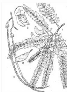
Sesbania grandiflora (L.) Poir. - 1, flowering branch; 2, flower bud; 3, flower; 4, fruit.