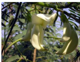
White flowered form