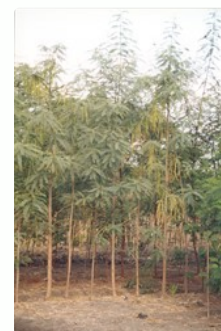
Pods pendulous, linear to slightly falcate, up to 60 cm long.