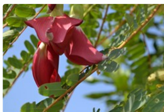
Red flowered form, Laos