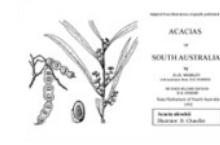
Source: WorldWideWattle ver. 2. Published at: www.worldwidewattle.com