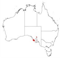
Acacia alcockii occurrence map. Occurrence map generated via Atlas of Living Australia ( https://www.ala.org.au ).