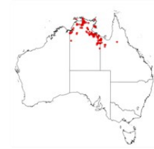
Acacia alleniana occurrence map. Occurrence map generated via Atlas of Living Australia ( https://www.ala.org.au ).