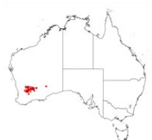
Acacia anfractuosa occurrence map. Occurrence map generated via Atlas of Living Australia ( https://www.ala.org.au ).