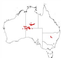
Acacia basedowii occurrence map. Occurrence map generated via Atlas of Living Australia ( https://www.ala.org.au ).