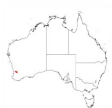
Acacia brachypoda occurrence map. Occurrence map generated via Atlas of Living Australia ( https://www.ala.org.au ).